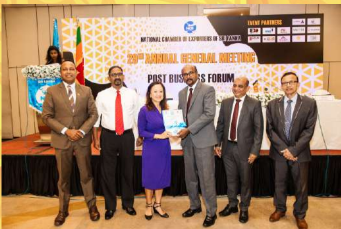
Arpitalian Compact Soles Pvt Ltd