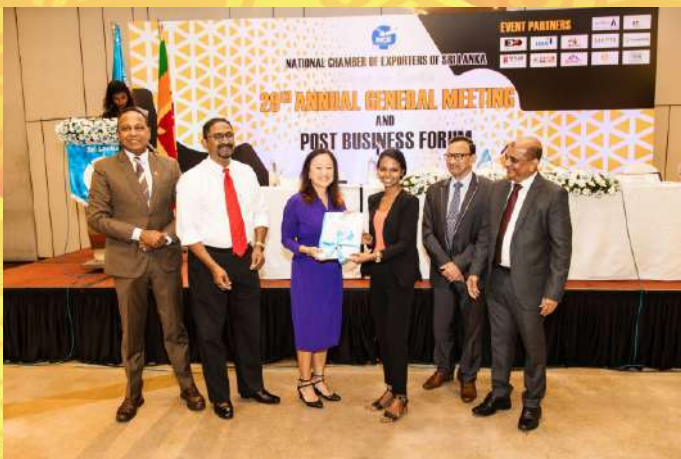
Derana Marketing Services(Pvt) Ltd

The certification recognizes companies that adhere to high standards of ethical conduct in their business operations. These principles encompass fair treatment of workers, safe working conditions, respect for the environment, and engagement with local communities. By awarding the CET, the NCE aims to promote ethical practices within the export sector and encourage more companies to adopt sustainable and responsible business practices. The certification not only benefits the companies receiving it but also enhances Sri Lanka's reputation as a responsible trading partner in the global market.