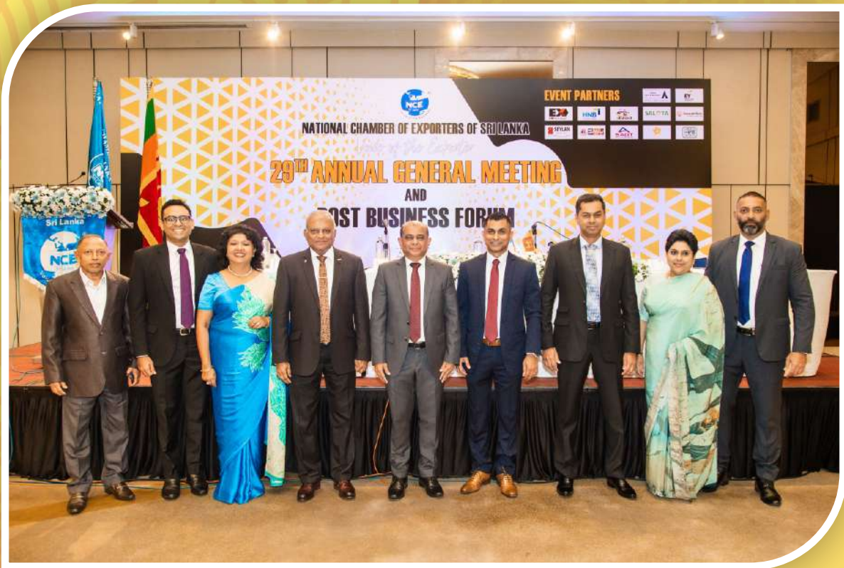
Members of the Management Committee(MC) who were re-elected for year 2024