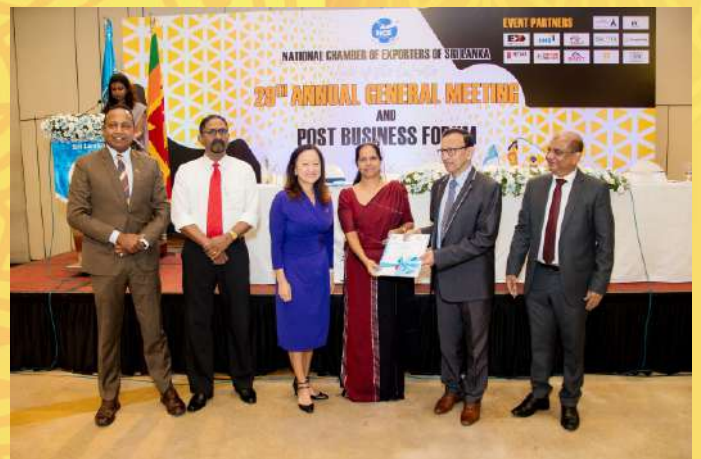
Noritake Lanka Porcelain (Pvt) Ltd