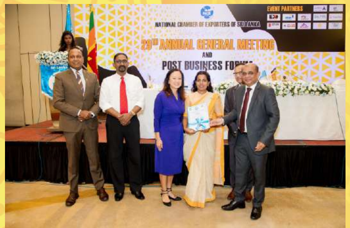
Talawakelle Tea Estates PLC