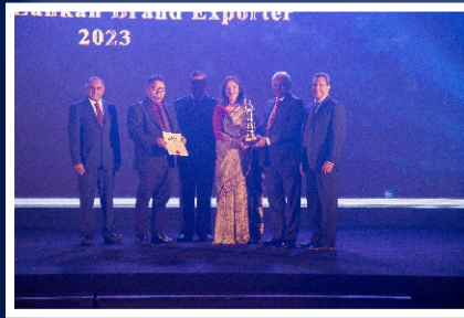
BEST SRI LANKAN BRAND EXPORTER FOR THE YEAR 2023 Ceylon Biscuit Limited