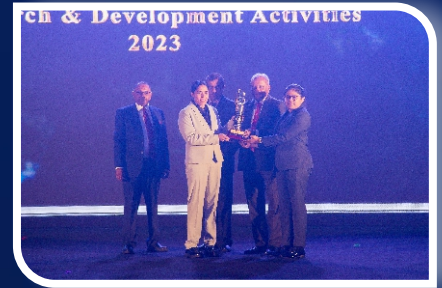
BEST PERFORMER IN RESEARCH & DEVELOPMENT ACTIVITIES Navik Mills (Pvt) Ltd