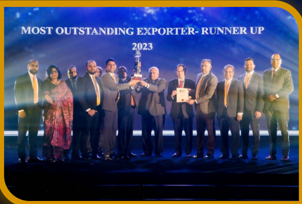
MOST OUTSTANDING EXPORTER RUNNER - UP OF THE YEAR 2023 LAUGFS Corporation (Rubber) Limited