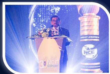
Dr. Nandalal Weerasinghe, Governor of the Central Bank addressing the gathering

The awards spanned various categories, emphasizing environmental stewardship, social accountability, and economic well-being. Special awards recognized differently-abled persons' contributions, the highest value-added exporters, the most innovative exporters, outstanding SME exporters, the best Sri Lankan brand exporter, the highest foreign exchange earner, and the most outstanding women exporter.