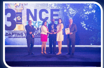
BEST VALUE ADDED EXPORTER- Services Sector OREL IT (Private) Ltd