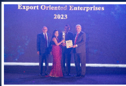
RECOGNITION OF DIFFERENTLY ABLED PERSONS BY EXPORT ORIENTED ENTERPRISES Samson Manufacturers (Pvt) Ltd