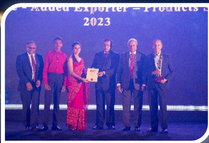
BEST VALUE ADDED EXPORTER -Products Sector Mike Biotech Asia (Pvt) Ltd