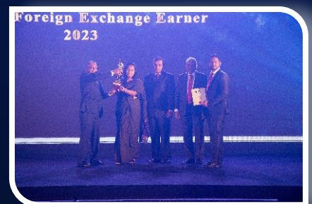
HIGHEST FOREIGN EXCHANGE EARNER New Lanka Cinnamon (Pvt) Ltd