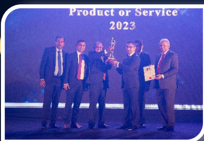
MOST INNOVATIVE EXPORTER OF A PRODUCT OR SERVICE D. Samson Industries (Pvt) Ltd