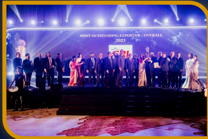
MOST OUTSTANDING EXPORTER OF THE YEAR 2023 Ceylon Biscuits Limited

As the curtains closed on the 31st NCE Export Awards, the echoes of success and the call to embrace change resonated through the corridors of Sri Lanka's export community, setting the stage for future accomplishments and solidifying the legacy of the NCE Export Awards in inspiring generations of exporters.