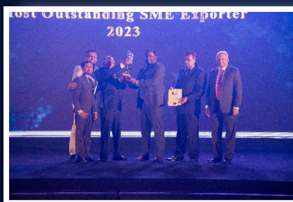
MOST OUTSTANDING SME EXPORTER 2023 Halpe Tea (Pvt) Ltd