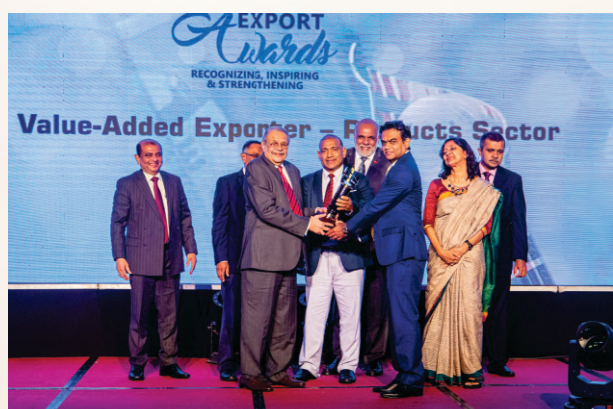
CBL Global Foods Limited Best Value-Added Exporter – Products Sector