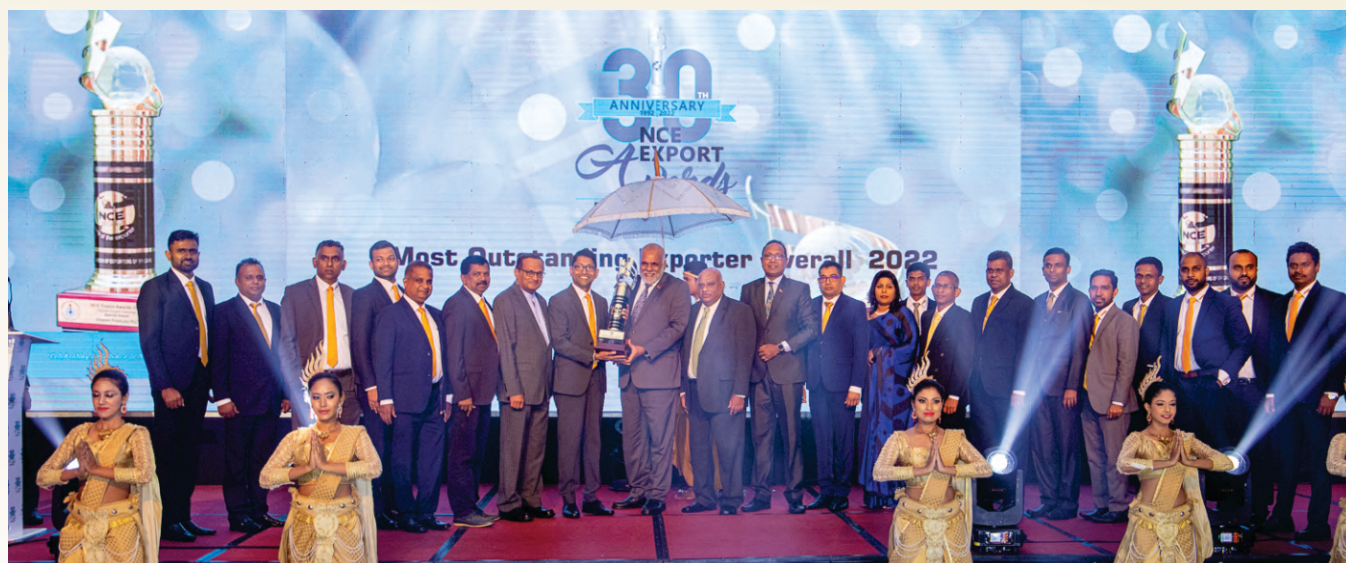
LAUGFS Corporation (Rubber) Ltd - Most Outstanding Exporter – Overall 2022

Special Awards presented at the 30 th Annual NCE Export Awards