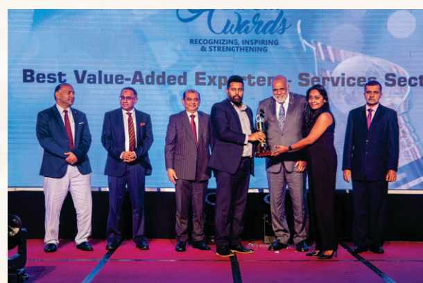
OREL IT (Pvt) Ltd Best Value-Added Exporter – Services Sector