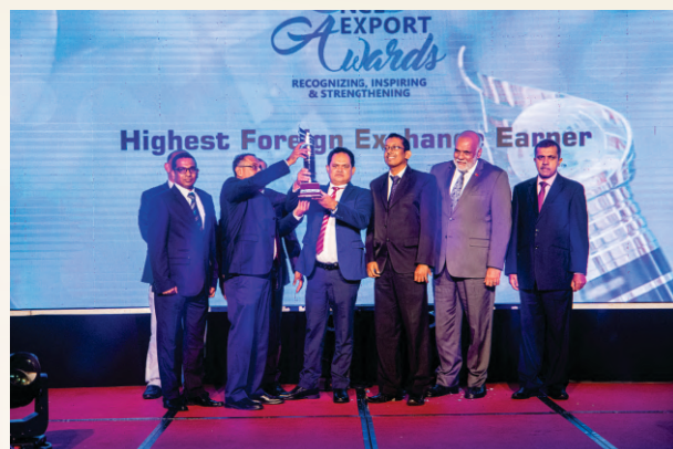
Dipped Products PLC Highest Foreign Exchange Earner