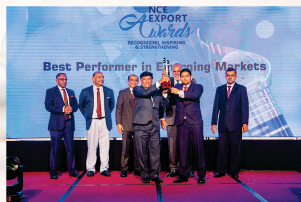
Joint Agri Products Ceylon (Pvt) Ltd Best Performing Exporter in Emerging Markets