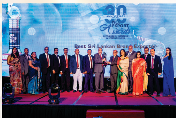
Ceylon Biscuits Limited Best Sri Lankan Brand Exporter