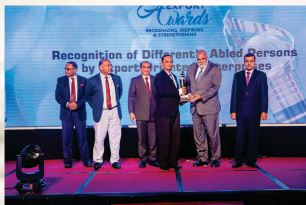
dkw-Aqua International (Private) Limited Recognition of differently abled persons by Export Oriented Enterprises