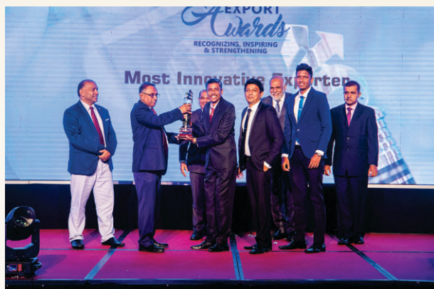
Samson International PLC Most Innovative Exporter

Special Awards presented at the 30 th Annual NCE Export Awards