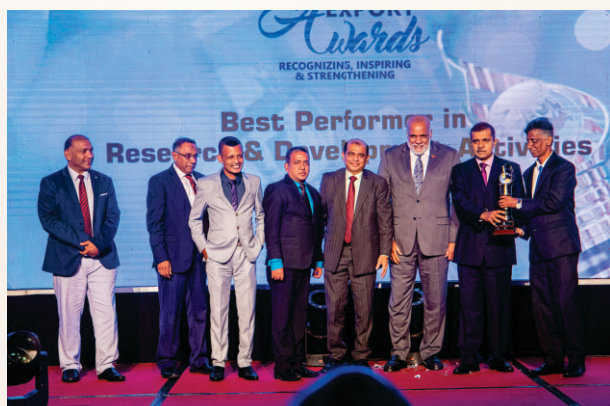
Samson International PLC Best Performer in Research and Development Activities