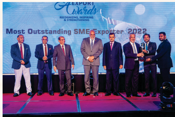
Ceyline Maritime Services (Pvt) Ltd Most Outstanding SME Exporter